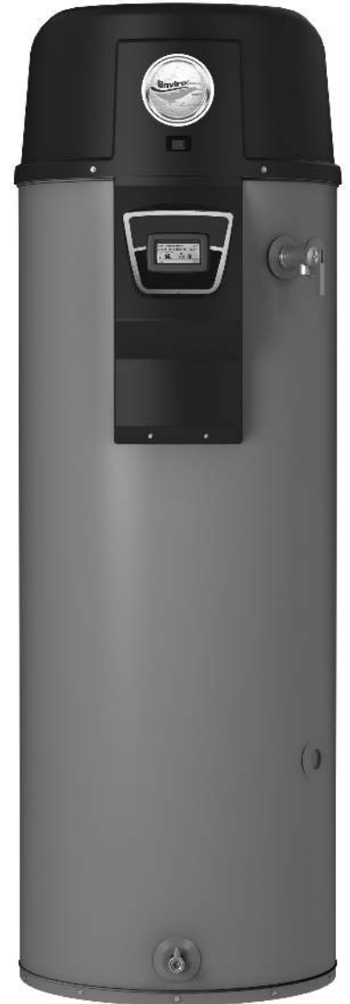
50 Gallon Model Shown

**In residential applications. Reduced warranty in commercial applications.