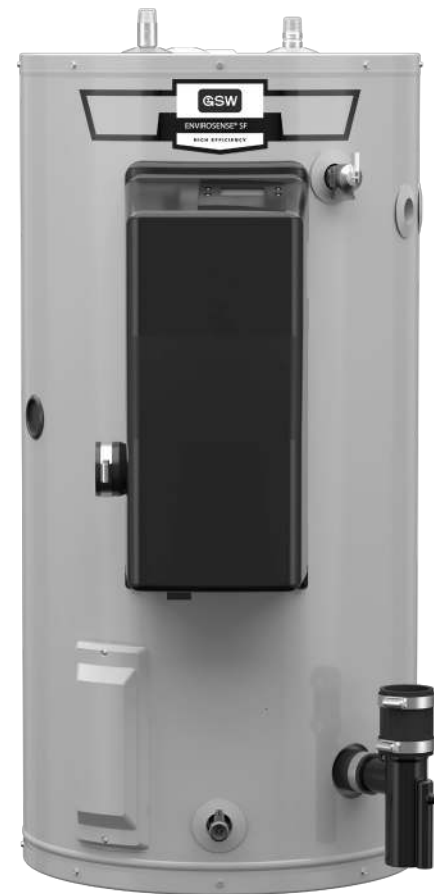
MODEL SHOWN ENV-40

*Continuous hot water based on 65,000 BTU unit, 2.8 GPM continuous flow with a 65°F inlet water temperature, 110°F outlet temperature, and installed per the manufacturer's instructions.