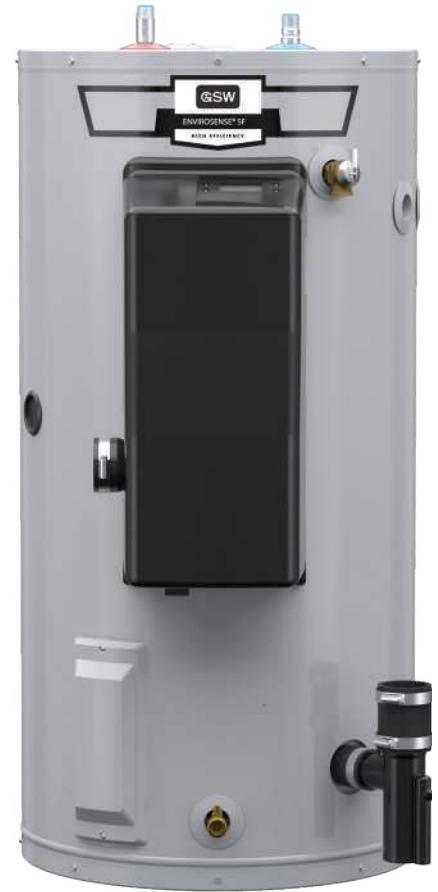
MODEL SHOWN ENV-40

*Continuous hot water based on 65,000 BTU unit, 2.8 GPM continuous flow with a 65°F inlet water temperature, 110°F outlet temperature, and installed per the manufacturer's instructions.